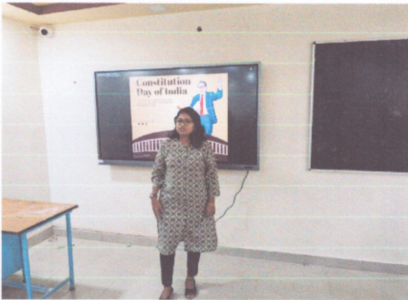
Fig.12. Constitution Day on November 26 th , 2023