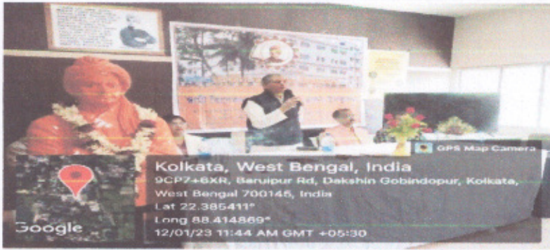
Fig.9&10&11. Celebration of National Youth Day in the Campus