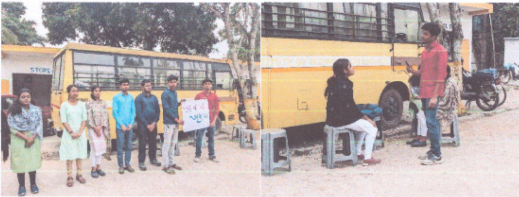
Fig.16&17. Street Drama: 'Ananda Ashram'