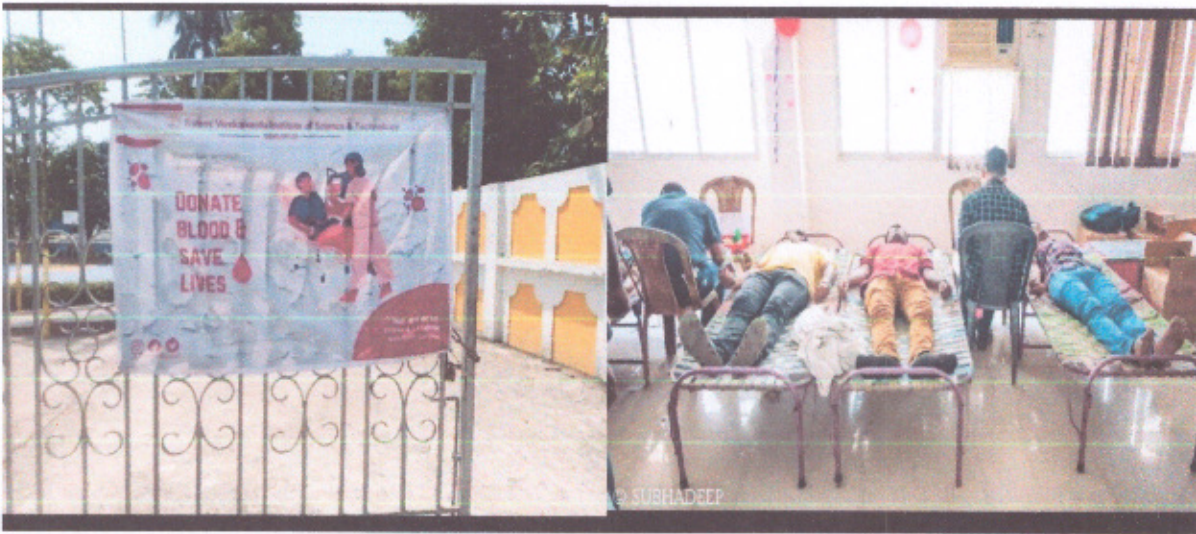
Fig.7&8. Blood Donation Camp