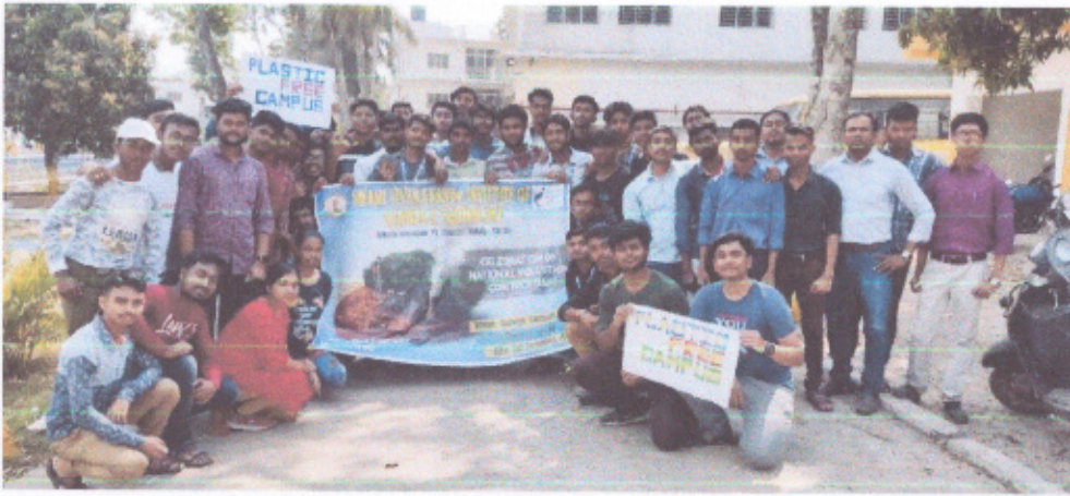
Fig.3. Plastic Free Campus