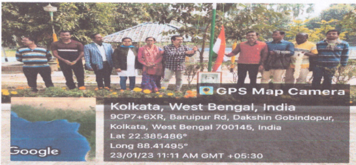
Fig.5. Republic Day Celebration