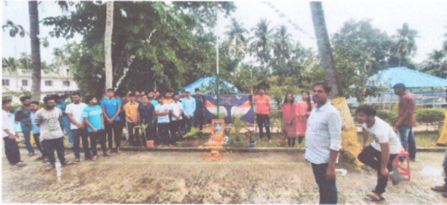
Fig.6 Azadi Ka Amrit Mahotsav