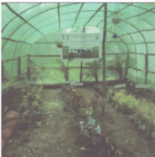
Fig.18&19. Tree Plantation Program