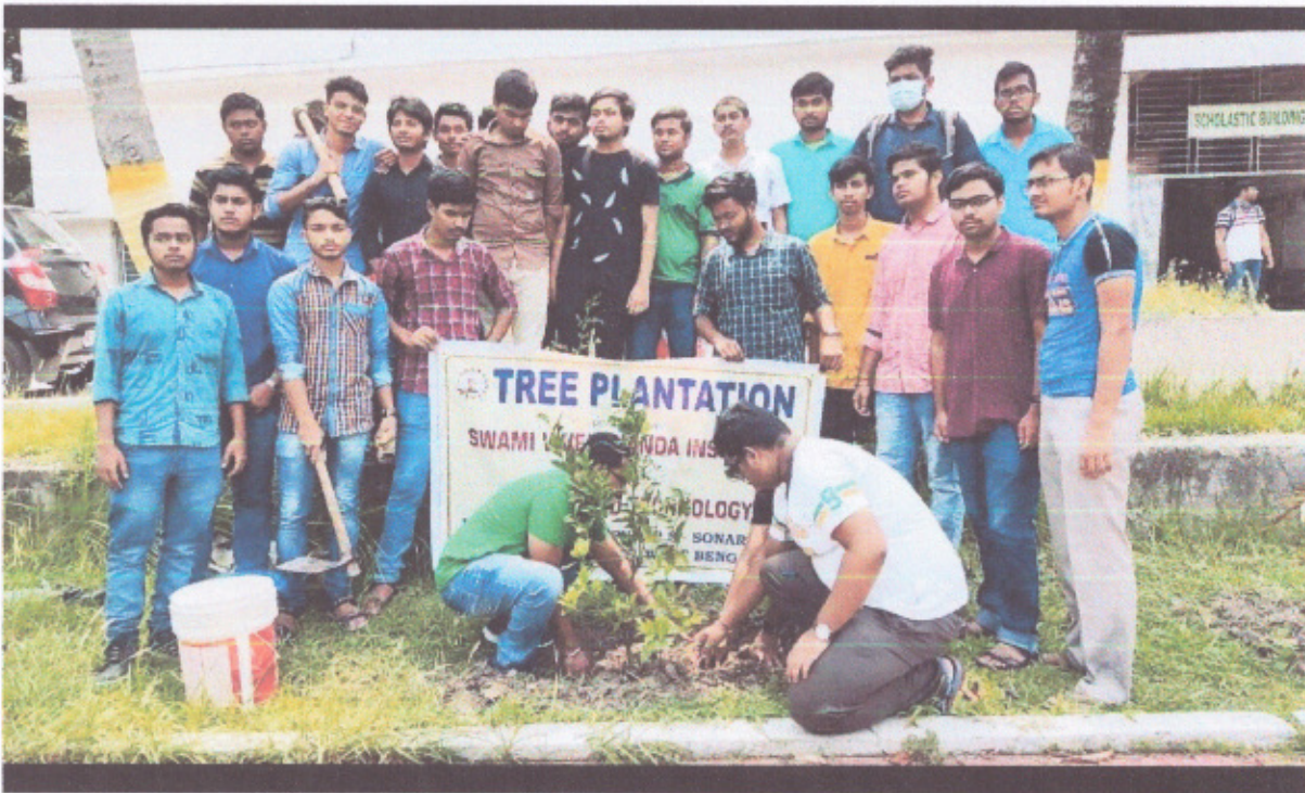
Fig.1. Tree Plantation Programme