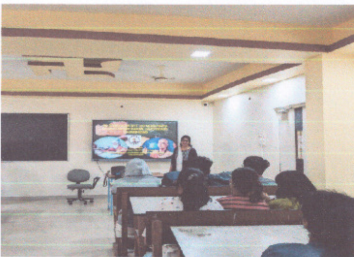
Fig.13. A symposium on Essence of Indian Knowledge Tradition