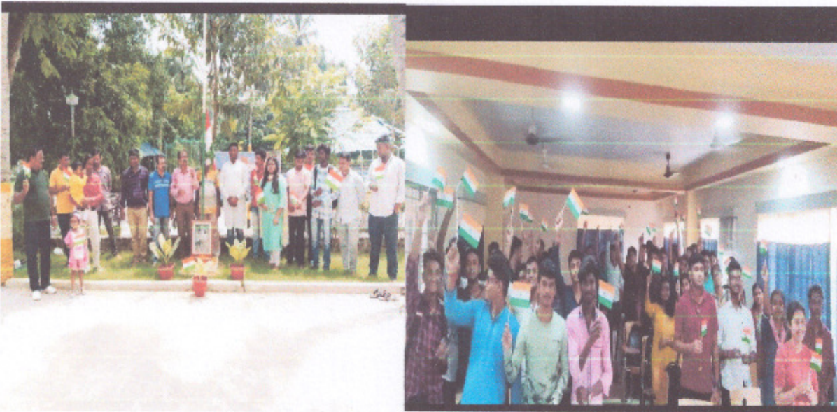
Fig.4. Independence Day Celebration