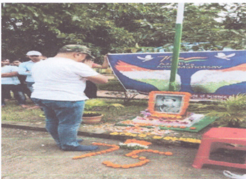
Fig.20&21. Independence Day Celebration