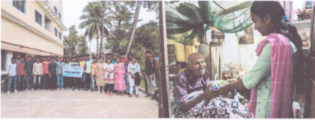
Fig.14&15. Old Age Home Visit