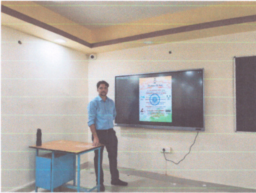
Fig.23.Awareness Talk on Constitutional Values