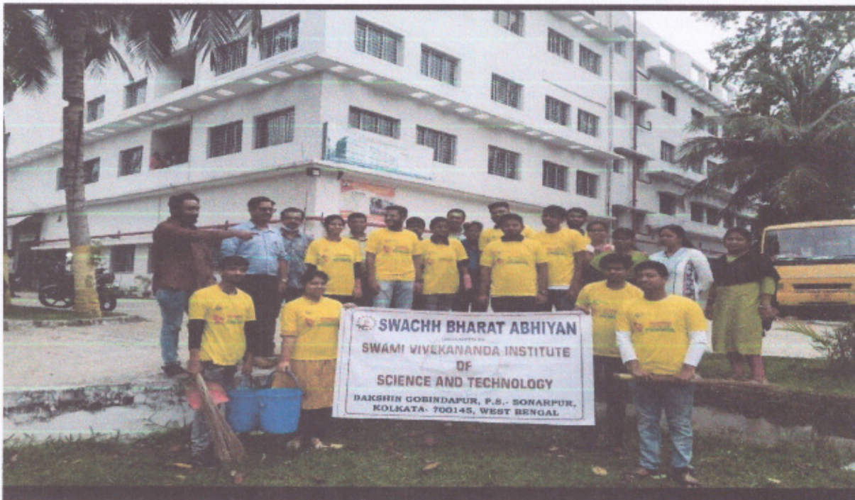
Fig.2. Swachh Bharat Abhiyan